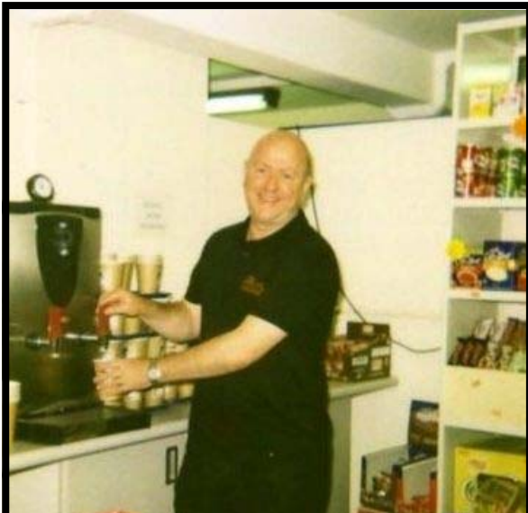
HMP Risley's #1 Governor pouring a cup of tea for one of the families visiting an offender in prison

POPS is a registered charity that was set up in 1988 by families who were