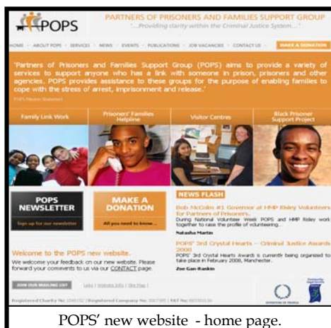
POPS' new website - home page.

POPS is proud to announce our newly designed website. We have new and exciting functions like: -